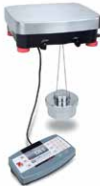
Weight below hook in use

Additionally, a weigh below hook offers the functionality to perform specific gravity tests or weigh items that cannot be easily placed on the weighing platform.