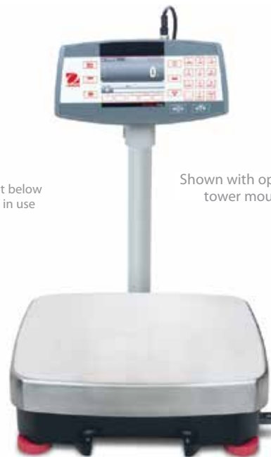
Shown with optional tower mount