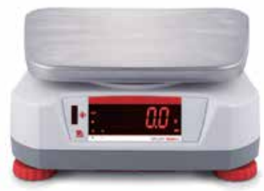
Rear Display with Integrated Touchless Sensor