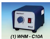
(1) WHM - C10A

Realize Precise Temperature Control by integrated K-type Thermo-sensor