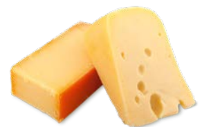
pH Determination in Hardened Cheese