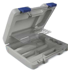
uGo™ Carrying Case