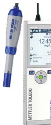
S3 Conductivity Routine Meter