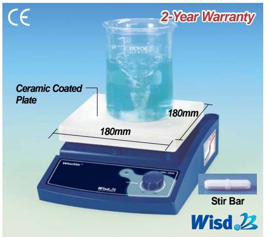
Premium Magnetic Stirrer with Stir Bar "MS-20A"

DAIHAN-brand<sup>®</sup> Premium Magnetic Stirrer, "MS-A", 180×180mm Ceramic-Coated Plate, with Certi. & Traceability with PWM Control System, Precise Speed Control, Ceramic Coated Al-Plate, up to 1,500 rpm, Max. 20 Lit.