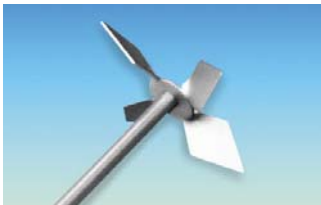
(3) Diamond-type 4×Bladed

DH.WOS501015 Impeller, "PL015", #304, \phi 8 \times L500 mm Rod, \phi 70 mm Blade DH.WOS501016 , "PL016", #304, \phi 8 \times L650 mm Rod, \phi 90 mm Blade DH.WOS501017 , "PL017", #304, \phi 8 \times L650 mm Rod, \phi 100 mm Blade