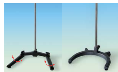
(3) "ST200" (4) "KA1177"