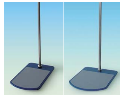
(1) "ST110" (2) "ST120"