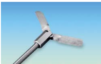
(4) Centrifugal-type 2×Bladed

DH.WOS501035 Impeller, "PL035", #304, \phi 8 \times L500 mm Rod, \phi 70 mm Blade DH.WOS501036 , "PL036", #304, \phi 8 \times L650 mm Rod, \phi 90 mm Blade