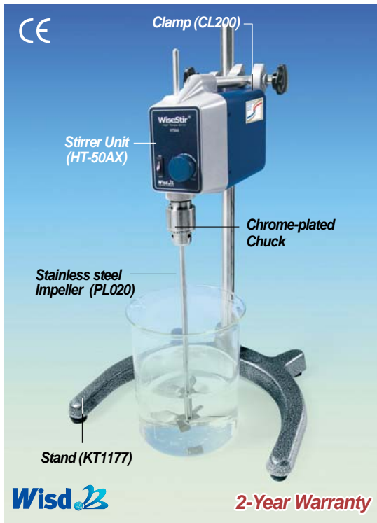
High-Torque Analog Overhead Stirrer, "HT-50AX" Package-set