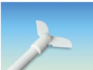
(5) Teflon Coated Centrifugal-type

DH.WOS501135 Impeller, "PL135", #304, \phi 10 \times L650 mm Rod, \phi 90 mm Blade DH.WOS501136 , "PL136", #304, \phi 10 \times L800 mm Rod, \phi 140 mm Blade