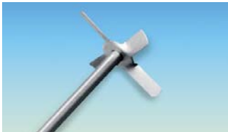
(2) Propeller-type 4×Bladed

DH.WOS501010 Impeller, "PL010", #304, \phi 8 \times L500 mm Rod, \phi 50 mm Blade DH.WOS501011 , "PL011", #304, \phi 8 \times L500 mm Rod, \phi 60 mm Blade DH.WOS501012 , "PL012", #304, \phi 8 \times L650 mm Rod, \phi 80 mm Blade DH.WOS501013 , "PL013", #304, \phi 8 \times L650 mm Rod, \phi 100 mm Blade