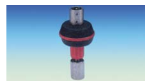
(6) Basic-type Coupling

(7) "KGW" Heavy-duty Metal Coupling, for \phi 6~ \phi 14mm Shafts