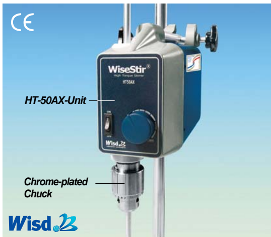
Analog High-Torque Overhead Stirrer, "HT-120AX" Unit only

※ Refer to page 204 for Product Line & Selection Guide