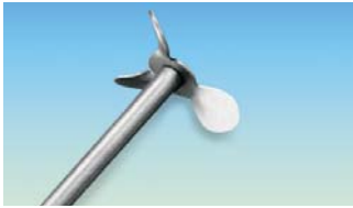
(1) Propeller-type 3×Bladed