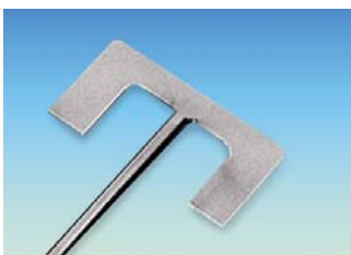
(6) Anchor-type 2×Bladed