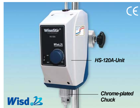
High-Speed Analog Overhead Stirrer "HS-120A -unit"