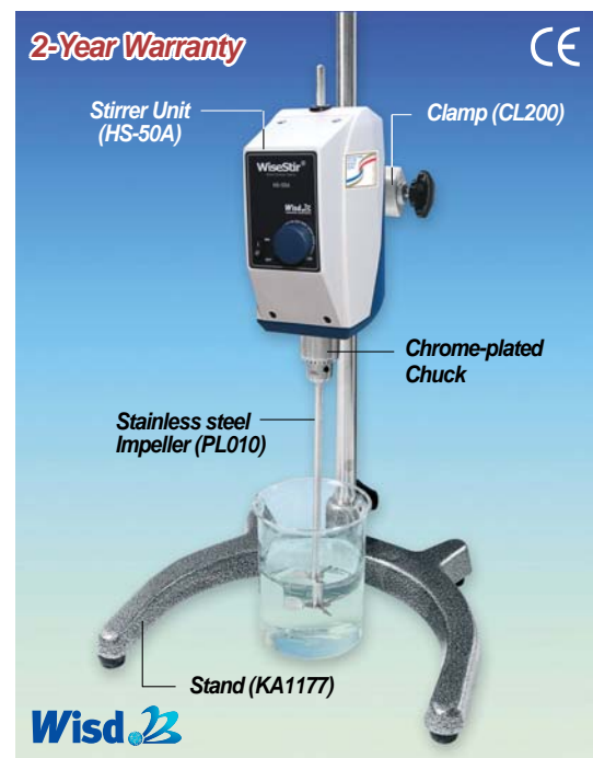
High-Speed Analog Overhead Stirrer "HS-50A -Set"

※ Refer to page 204 for Product Line & Selection Guide