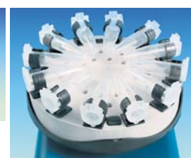
(3) Microtube Platform Head, 0.5~2.0ml Tube "PM310" (Optional)