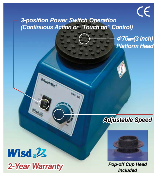
Multifunction Vortex Mixer Set "VM-10" with \phi 76mm(3") Platform (PM110)