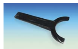
Remove Applicator (Included)