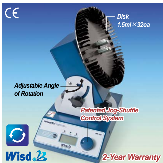
Programmable Digital Rotator (RT-10) with 1.5ml x 32ea Disk (WRT120)