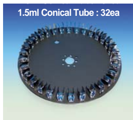
(3) Disk, “WRT120”