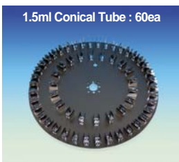
(4) Disk, “WRT130”