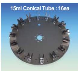
(2) Disk, “WRT110”