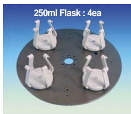
(5) Disk, “WRT140”