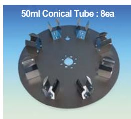
(1) Disk, “WRT100”