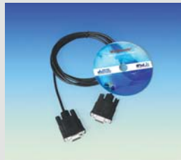
RS232C Cable & Software