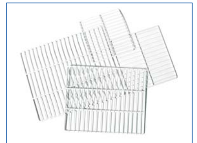
Wire Shelves, Teflon Coated steel (Included)

New Low Temperature(B.O.D) Incubator "ThermoStable IR-150"