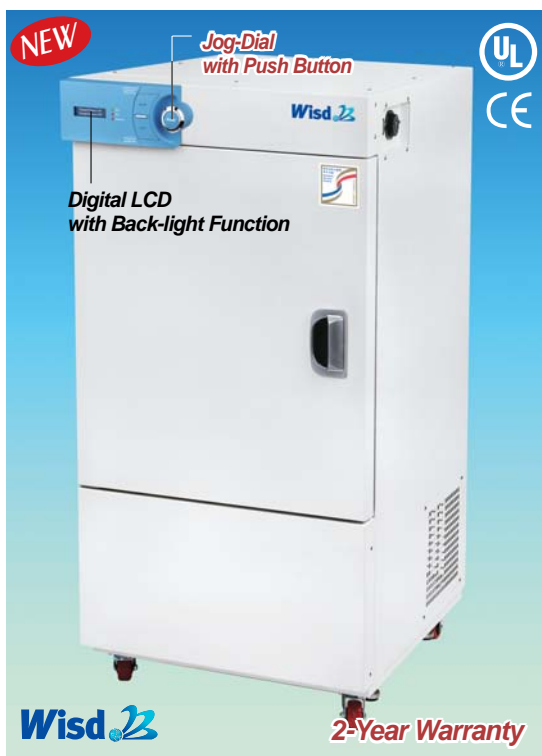
New Low Temperature(B.O.D) Incubator "ThermoStable IR-150"