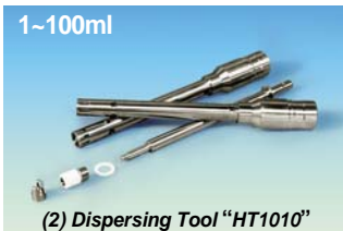
(2) Dispersing Tool "HT1010"