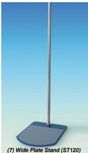
(7) Wide Plate Stand (ST120)