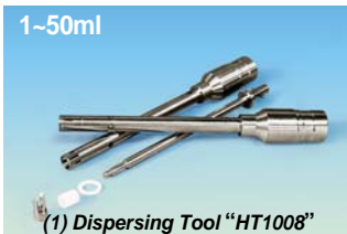
(1) Dispersing Tool "HT1008"