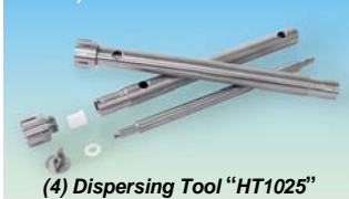
(4) Dispersing Tool "HT1025"