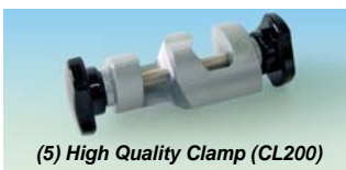
(5) High Quality Clamp (CL200)