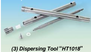
(3) Dispersing Tool "HT1018"