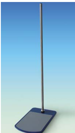
(6) Standard Plate Stand (ST110)

* Test Condition : 1.8 liters of water in the 2 liters capacity beaker.