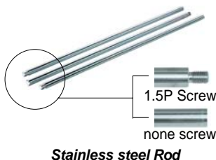
Stainless steel Rod

DH.WOS502011 Stainless steel Rod, "RD511", φ16×h800mm, 1.5P Screw DH.WOS502012 "RD512", φ16×h1000mm, 1.5P Screw DH.WOS502013 "RD513", φ16×h1200mm, 1.5P Screw DH.WOS502021 "RD521", φ23×h800mm, 1.5P Screw DH.WOS502022 "RD522", φ23×h1000mm, 1.5P Screw DH.WOS502023 "RD523", φ23×h1200mm, 1.5P Screw