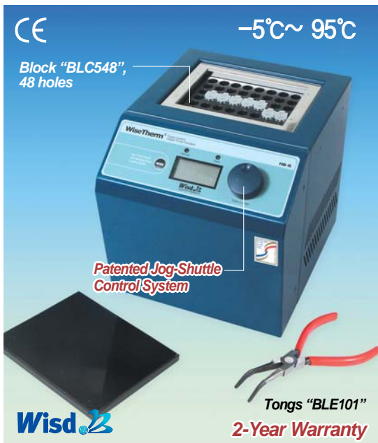
Heat/Cool Package-Set "HB-R48-Set" with Block "BLC548" for 1.5/2ml Centrifuge Tube × 48 holes

히팅 / 쿨링 블록, 블록 교체 가능, 아크릴 리드 포함, Peltier Cooling System, Digital Timer & PID Control System, Interchangeable Blocks