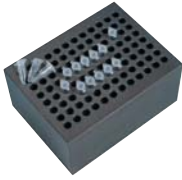
(1) “BLC596” 0.2ml PCR Tube × 96 holes