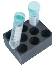
(10) “BLC008” 50ml Conical Tube × 8 holes