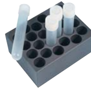
(7) “BLT628” φ 16.5mm Tube × 24 holes