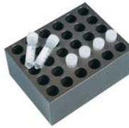
(6) “BLT535” φ 15mm Tube × 30 holes