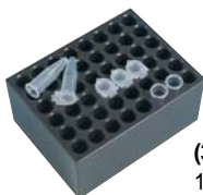
(3) "BLC548" 1.5/2ml Centrifuge Tube × 48 holes