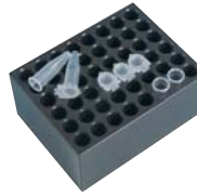
(3) “BLC548” 1.5/2ml Centrifuge Tube × 48 holes Included in the Package-Set