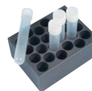
(8) “BLT828” φ 18mm Tube × 24 holes