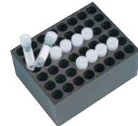
(4) “BLT248” φ 12mm Tube × 48 holes