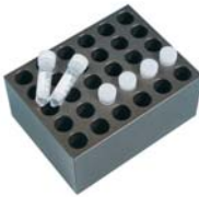
(5) “BLT335” φ 13mm Tube × 30 holes