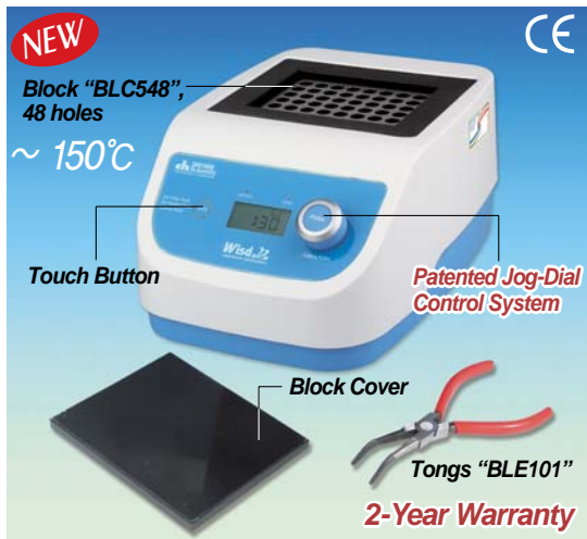
(a) New Heating Block/Dry Bath "MaXtable H10"

DAIHAN-brand® High-performance Heating Block/Dry Bath, "MaXtable™ H10", up to 150°C, ±0.1°C NEW with Fuzzy Control, Molded Heater, Modular Anodized Aluminum Blocks, Acrylic Lid, Touch-button Controller, with Certi. & Traceability 히팅 블록, 디지털 퍼지 컨트롤 시스템, 터치버튼식 조절기, 일체형 주물 히터, 블록 교체 가능, 아크릴 리드/블록용 집게 포함