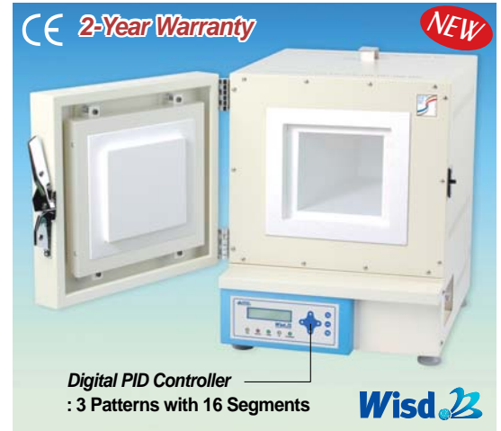
Digital PID Controller : 3 Patterns with 16 Segments