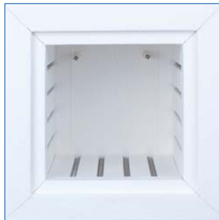
Inner Chamber of Exposed Heating Elements-type