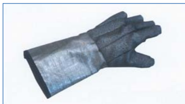
(2) Heat-resistant Gloves