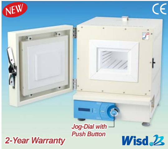
1200°C Digital Muffle Furnace, Exposed Heating Elements-type "FHX-14"