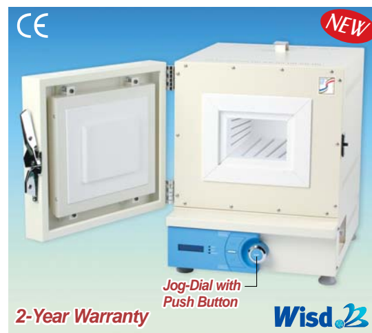
1000 °C Digital Muffle Furnace, Exposed Heating Elements-type "FX-14"