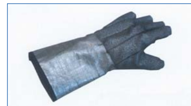
(2) Heat-resistant Gloves