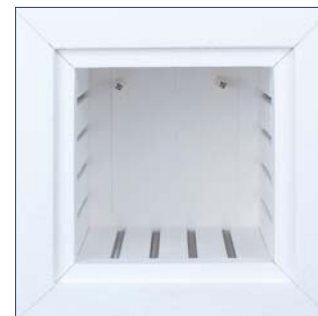
Inner Chamber of Exposed Heating Elements-type