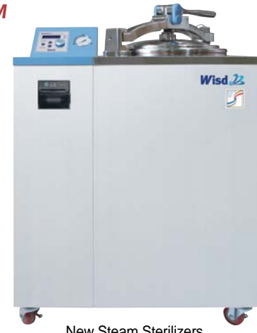
New Steam Sterilizers, Digital Fuzzy Controlled Autoclaves

DAIHAN's new Autoclaves are upgraded with a simpler and more ergonomic design. Unique and innovative 'Electronic Safety Door Locking System' and 'Steam Condensing Mechanism' maximize the user safety, which is the most critical feature of autoclave product. New Lever-type Door Handle makes anybody open and close the door very easily and safely. Both of Solid and Liquid cycles are offered up to the samples to be sterilized, which ensures optimum sterilizing performance.