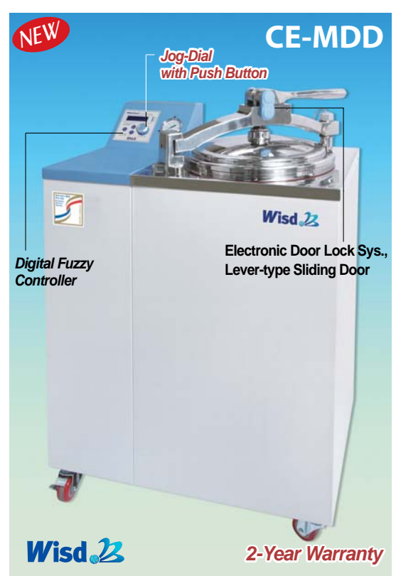
(1) New Standard-model, "MaXterile 80"

DAIHAN MaXterile<sup>™</sup> Digital Fuzzy-control Autoclaves, Standard & Recorder-type, 47-/60-/80-/100-Lit. Steam Strtilizer, Electronic Door Lock Sys., Lever-type Sliding Door, Steam Condensing Mechanism, Max.2 kgf/cm², up to 132 °C