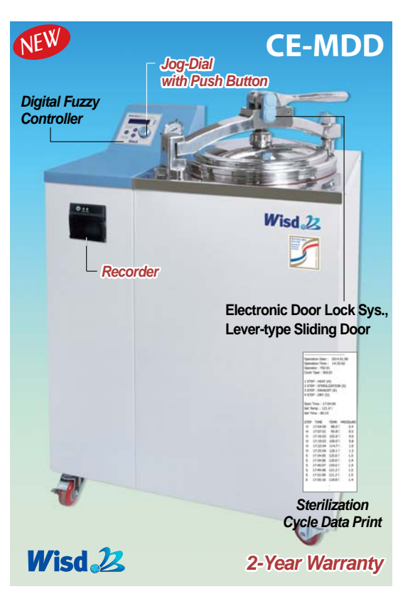
(2) New Recorder-model, "MaXterile 80R"