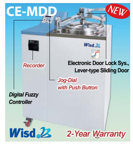
(2) New Recorder-model, "MaXterile 80R"