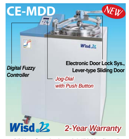
(1) New Standard-model, "MaXterile 80"

DH.WAC30047 Validation Service(IQ, OQ), "ACV47", for "MaXterile 47" DH.WAC30060 "ACV60", for "MaXterile 60" DH.WAC30080 "ACV80", for "MaXterile 80" DH.WAC30100 "ACV100", for "MaXterile 100" DH.WACR0047 Validation Service(IQ, OQ), "ACRV47", for "MaXterile 47R" DH.WACR0060 "ACRV60", for "MaXterile 60R" "ACRV80", for "MaXterile 80R" DH.WACR0080 DH.WACR0100 , "ACRV100", for "MaXterile 100R"