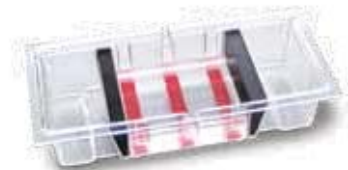
Horizon® 58 Gel Casting System

The Horizon® 11·14 casting system can be levelled by four levelling feet. For the Horizon® 58 casting system an additional casting/levelling tray is available.