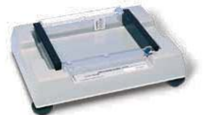
Horizon® 11·14 Gel Casting System