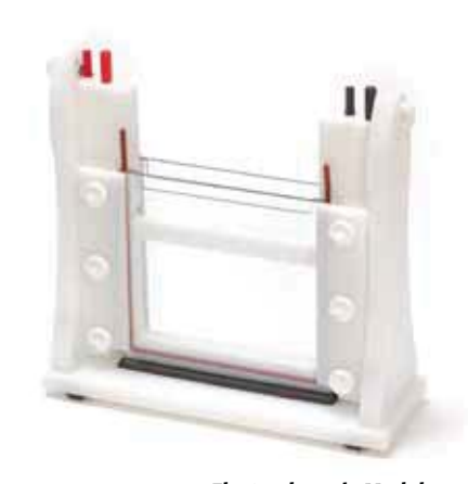
Electrophoresis Module and Casting Stand

In a second step, the electrophoresis module with the glass plates sandwiches is inserted into the specially designed gel casting stand and it is fixedeasily and reliable by two eccentric vices. By the use of a unique high-tech material for the gasket in the casting stand and special anti-slip device of the side clips leakage proof is guaranteed. After polymerisation of the gels, the complete assembly of electrophoresis module and glass plate sandwiches are taken from the casting stand into the buffer tank for electrophoretic separation. Specially formed slots in the side walls of the buffer tank allow a rapid and safe positioning of the module.