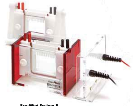
Eco-Mini System E

The Blot Module for Eco-Mini is available separately and will convert the corresponding electrophoresis apparatus into a powerful wet-blotter (does not apply to the Eco-Mini E and Eco-Mini System E).