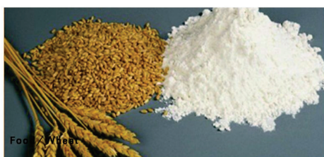
Food / Wheat