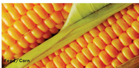
Food / Corn