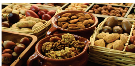
Food / Nuts